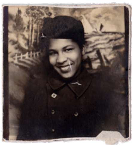
Photo booth images are intimate portraits that allow the subject to represent themselves as they'd like. Enter the booth, draw the curtain and, make your own art. These images are a precursor to what we think of today as DIY (Do It Yourself) culture. So these images are particularly suited to being compiled in a zine.